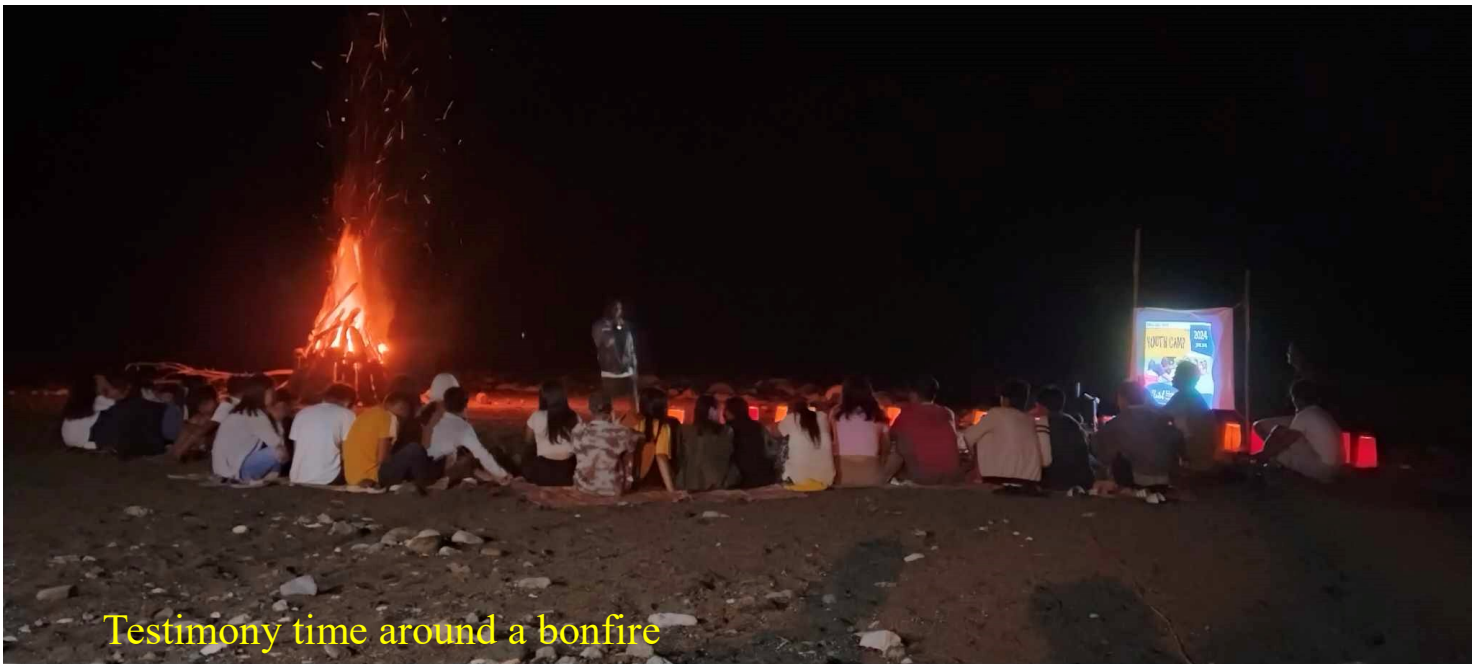
Testimony time around a bonfire