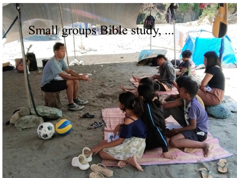
Small groups Bible study, ...